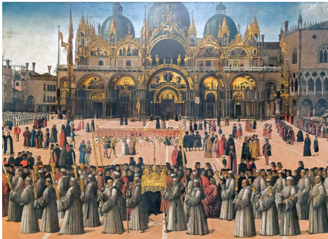
Gentile Bellini Procession in Piazza San Marco (detail) 1490 Accademia, Venice