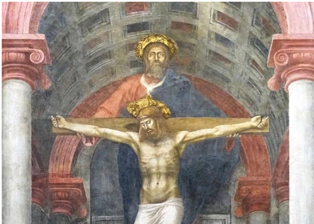
Masaccio The Holy Trinity (detail) c.1427 Santa Maria Novella, Florence.