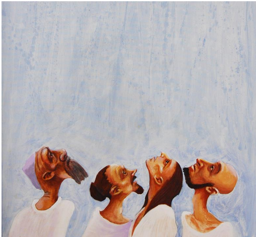
Chris Cook Men of Galilee (detail) private collection