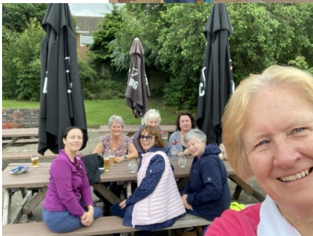
The Coventry Pilgrims