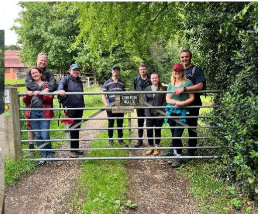
The Rugby Pilgrims