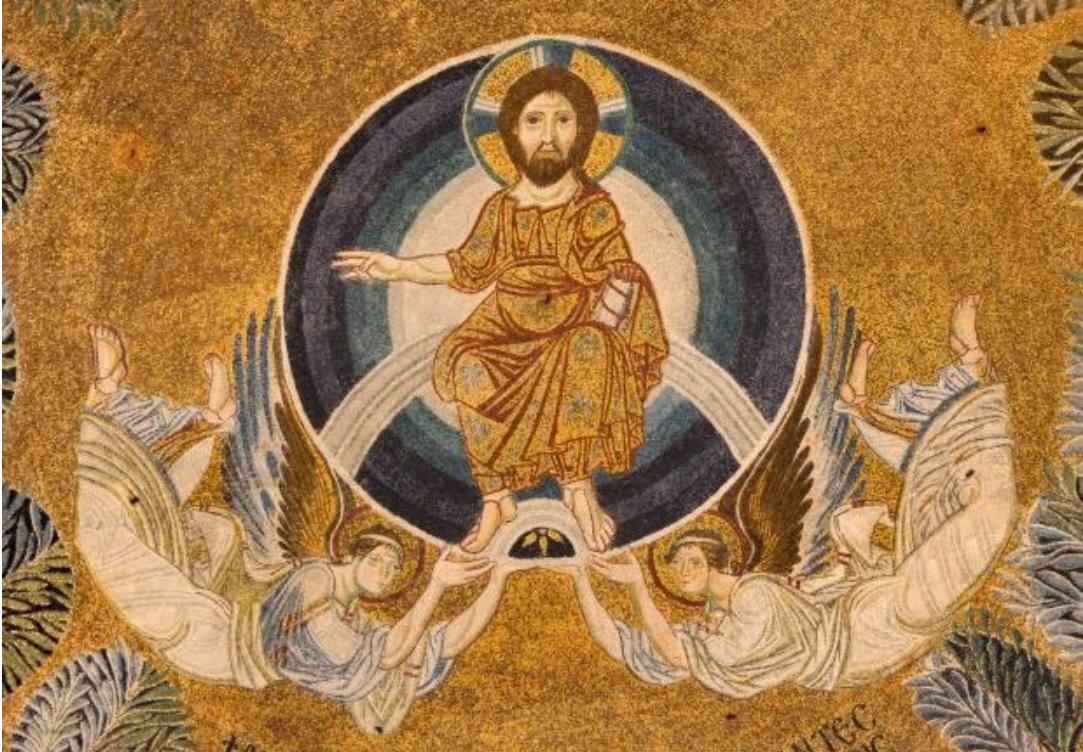
Agia Sophia church, mosaic of the Ascension of Jesus Christ (9th C) Thessaloniki, Greece