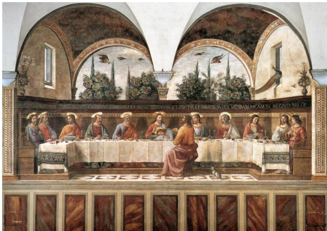
Domenico Ghirlandaio The Last Supper (fresco) 1480 Ognissanti, Florence