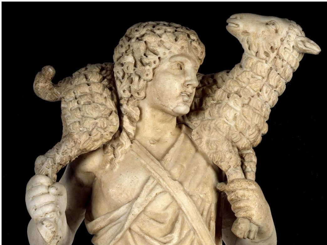
Statuette of the Good Shepherd 4th century A.D., 18th century A.D. Vatican Museums, Rome