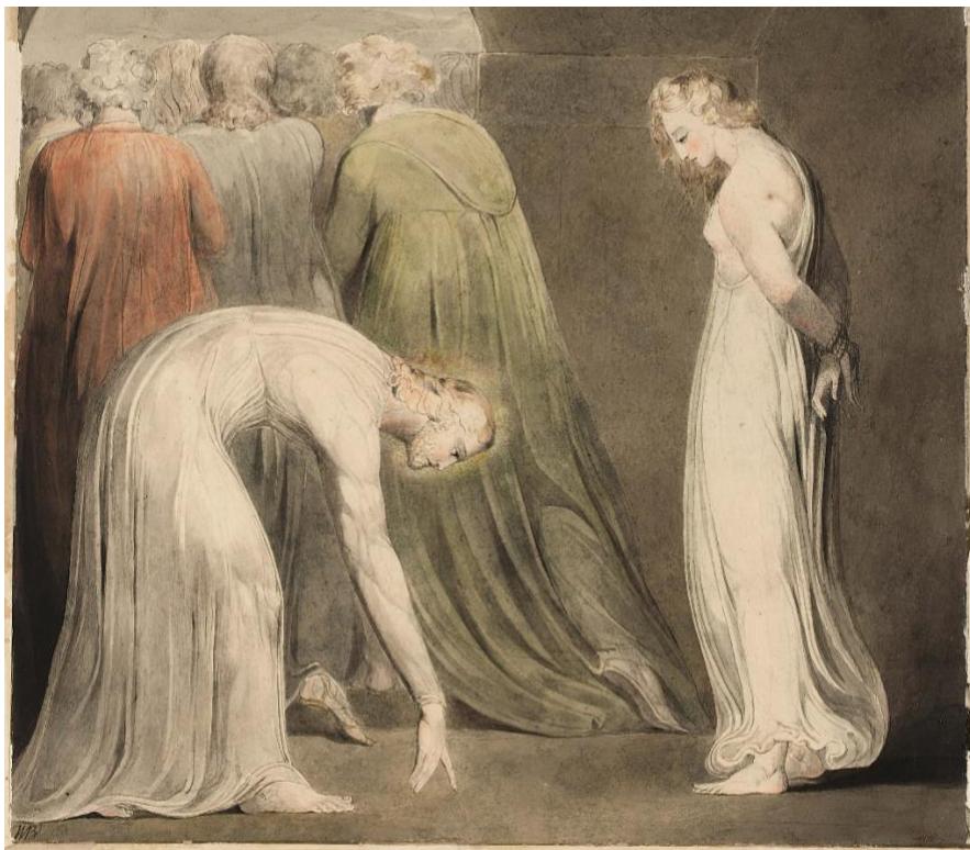
W. Blake (1757–1827) The Woman Taken in Adultery Museum of Fine Arts, Boston.