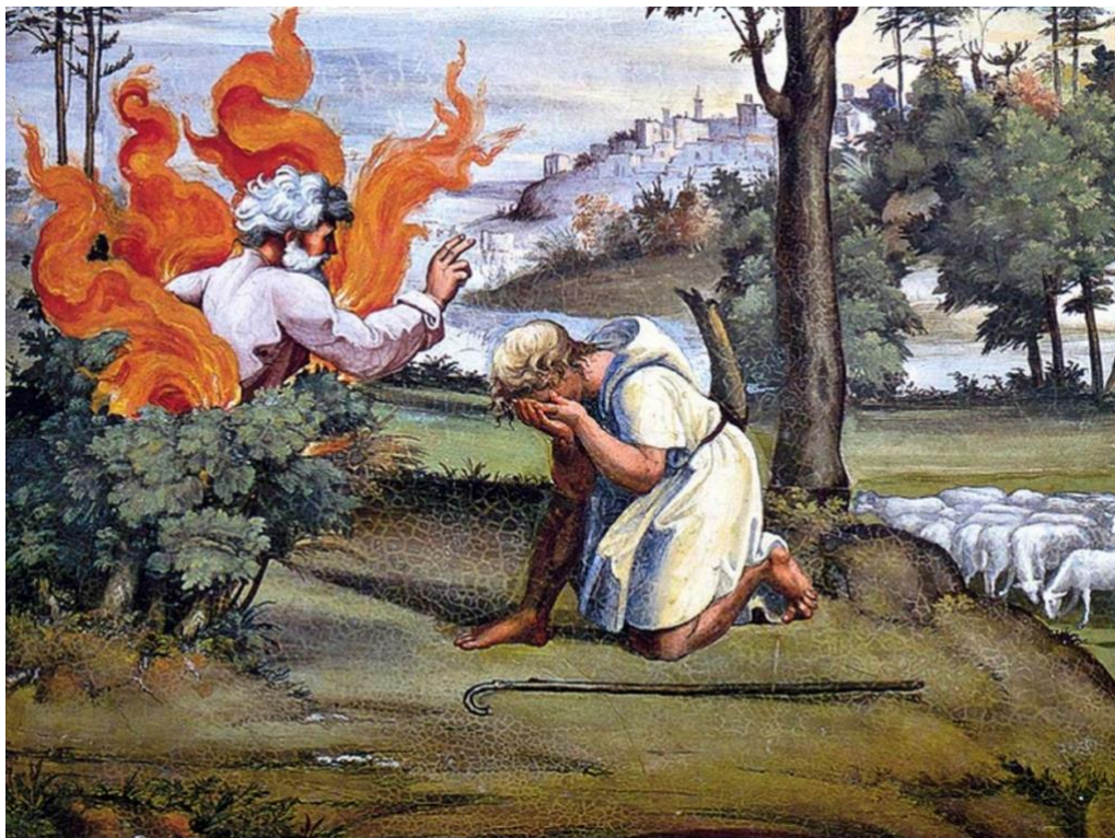
Raphael Sanzio Moses and the Burning Bush Fresco 1519 Vatican