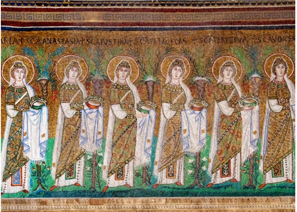
Vincentia, Perpetua, Felicitas, Iustina, Anastasia, Daria, 5th–6th Century, Sant'Apollinare Nuovo, Ravenna

Eighth Sunday in Ordinary Time 2 March 2025