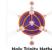
Holy Trinity Hethe

The Parishes of the Immaculate Conception & Holy Trinity are part of the Archdiocese of Birmingham: Registered Charity No: 234216