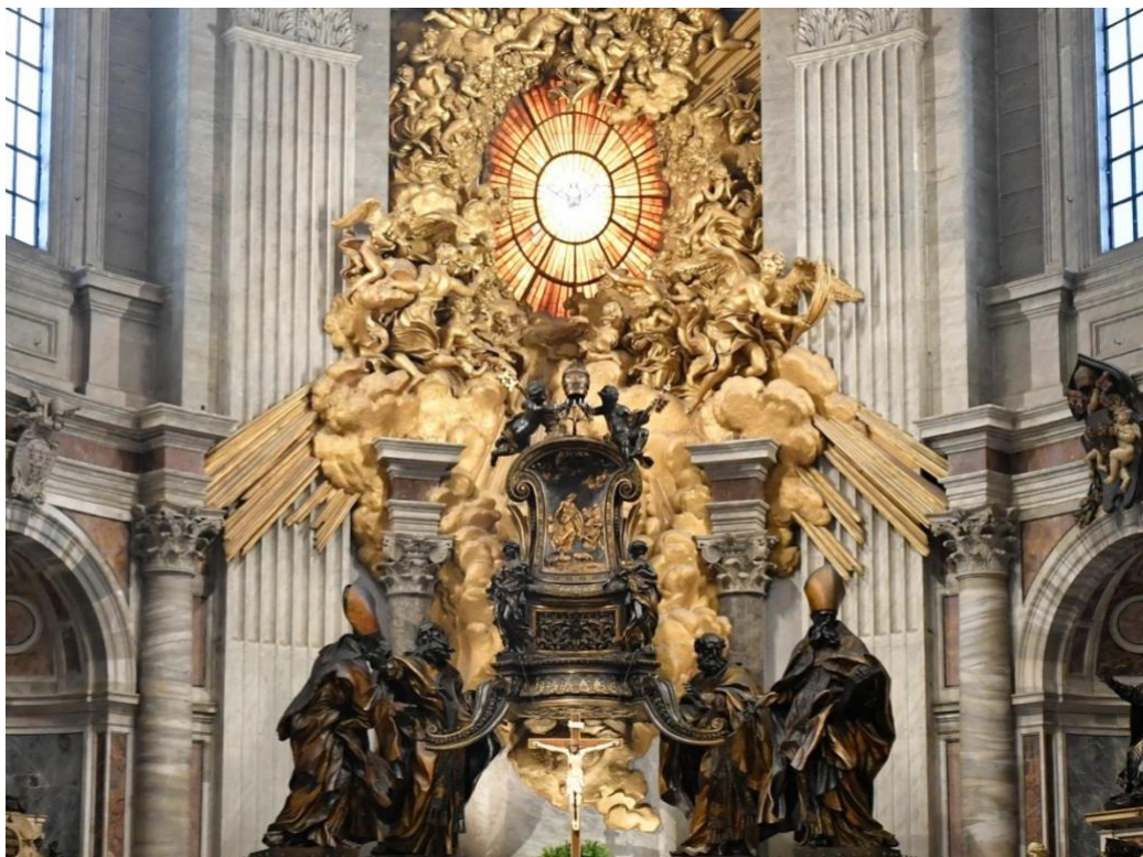
Bernini Altar of the Chair bronze reliquary for the historic Chair of St Peter 1666 St. Peter's Basilica, Vatican

Sixth Sunday in Ordinary Time 16 February 2025