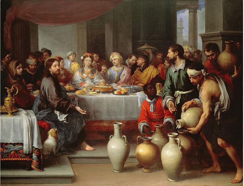
Bartolome Esteban Murillo The Marriage Feast at Cana c.1675 Barber Institute of Fine Arts, Birmingham

Second Sunday of the Year 19 January 2025