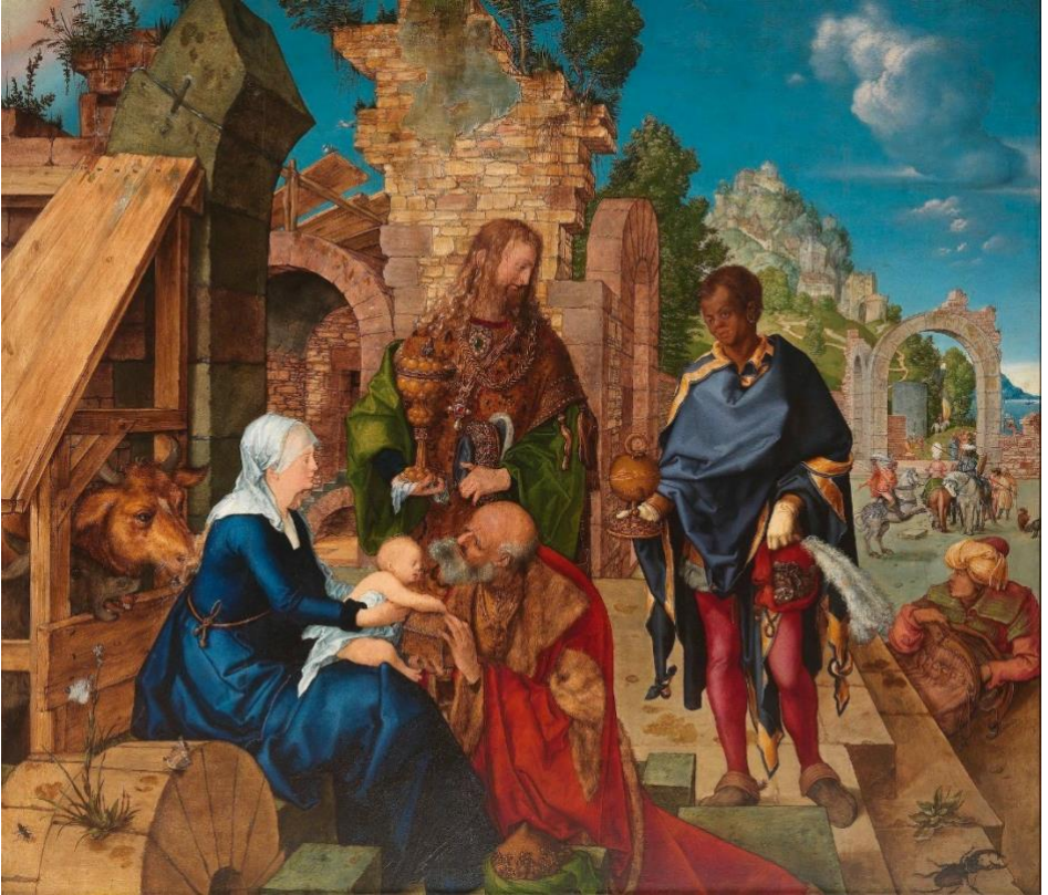
Albrecht Dürer Adoration of the Magi 1504 Uffizi, Florence