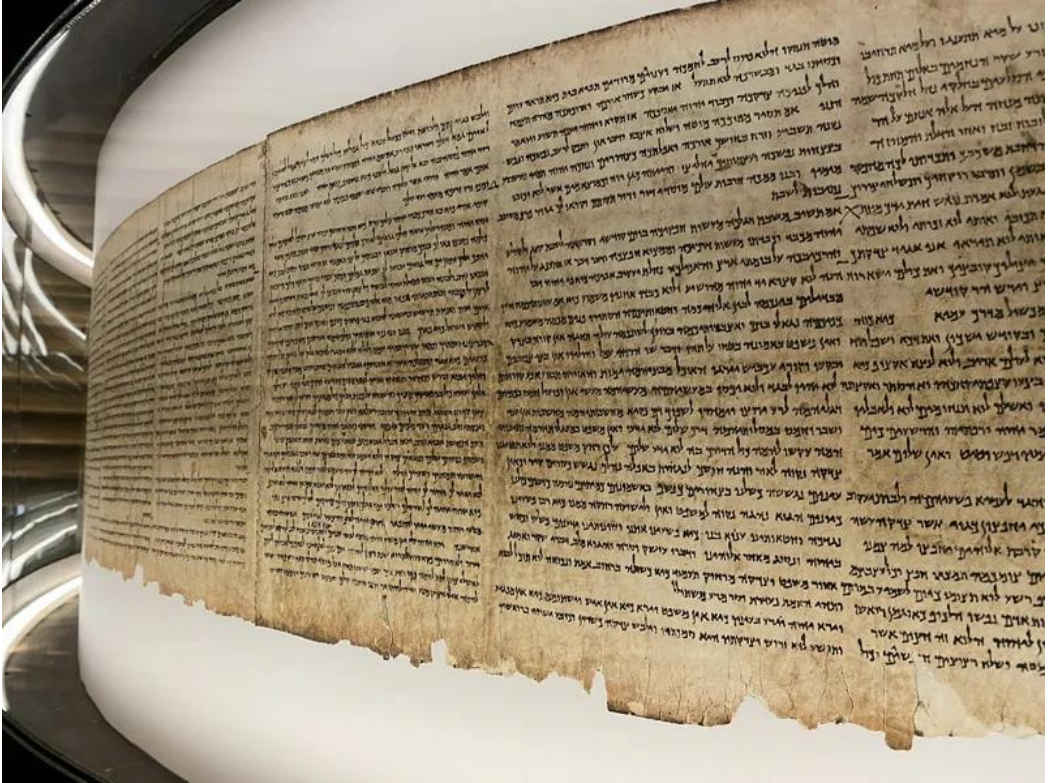
The Great Isaiah Scroll c.100 BC, Shrine of the Book, Israel Museum, Jerusalem

Third Sunday of the Year 26 January 2025