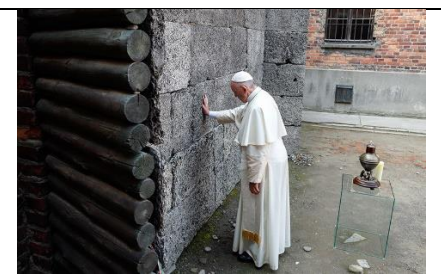
Pope Francis praying at the Wailing Wall