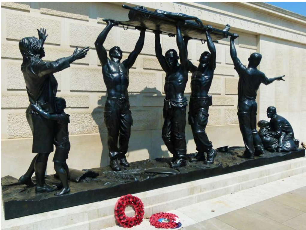
Sculpture in the Armed Forces Memorial section of the National Memorial Arboretum, Alrewas, Staffordshire

Thirty second Sunday of the Year 10 November 2024