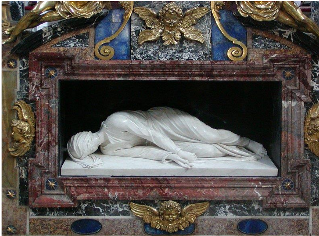
Stefano Maderno St. Cecilia marble, 1600, Basilica of Santa Cecilia in Trastevere, Rome.

Thirty third Sunday of the Year 17 November 2024