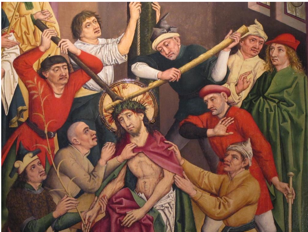
The Passion of Christ (detail) Master of the Drapery Studies 1485 Old Saint Peter's Church, Strasbourg

Twenty-ninth Sunday of the Year 20 October 2024