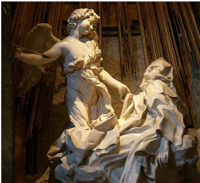
Bernini Ecstasy of St Teresa 1647-1652 Santa Maria della Vittoria, Rome

Twenty-eighth Sunday of the Year 13 October 2024