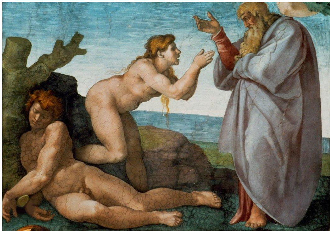
Michelangelo Buonarroti The Creation of Eve Sistine Chapel ceiling, Vatican 1508-1512

Twenty-seventh Sunday of the Year 6 October 2024