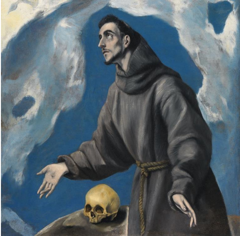
El Greco St Francis Receiving the Stigmata 1590-1595 National Gallery of Ireland

Twenty-sixth Sunday of the Year 29 September 2024