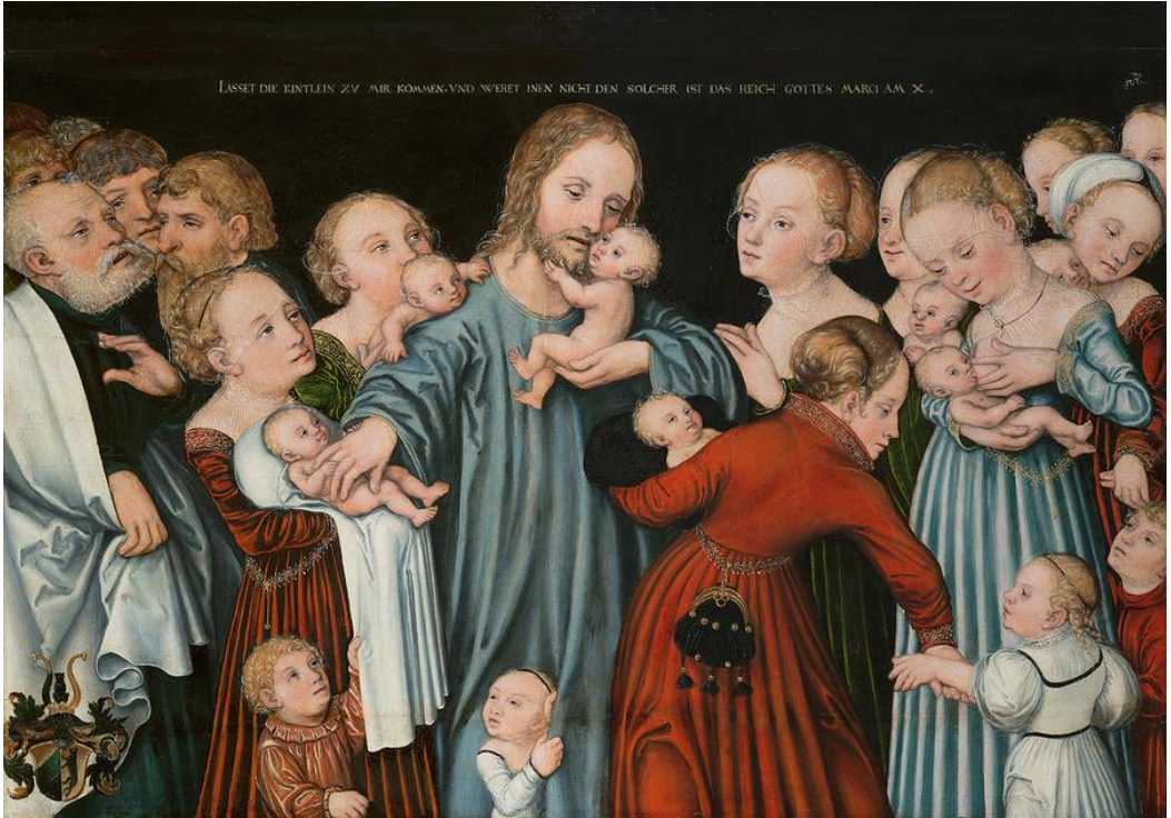
Lucas Cranach the Younger Suffer the Little Children to Come unto Me 1550, Prague

Twenty-fifth Sunday of the Year 22 September 2024