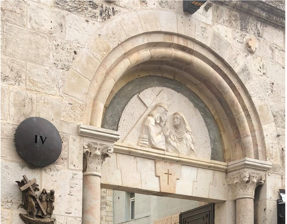
The Fourth Station, Jesus meets his Sorrowful Mother, Via Dolorosa, Jerusalem

Twenty-fourth Sunday of the Year 15 September 2024