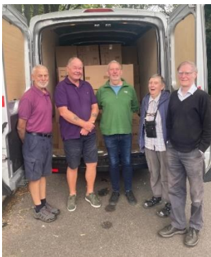
The first van load pictured here with 688 boxes.

Princethorpe College assist with the collection of items for the shoe-boxes, a donation towards some of the transport costs together with a member of staff to drive one of their vans to the warehouse hub in Evesham. Thank you Princethorpe College!