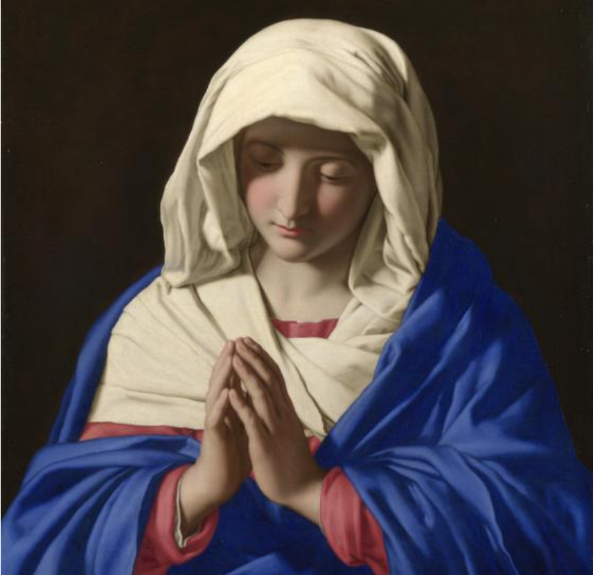
Sassoferrato The Virgin in Prayer 1640-1650 National Gallery, London