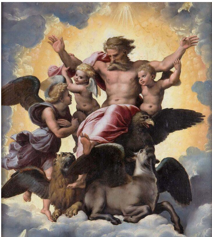
Raphael Ezekiel's Vision (detail) 1517–1518 Palazzo Pitti Florence

Fourteenth Sunday of the Year 7 July 2024