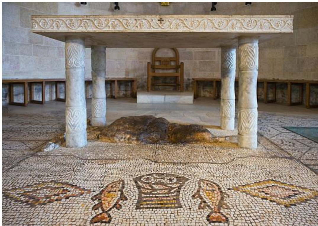
4 th Century loaves & fishes mosaic, Church of the Multiplication, Tabgha, Israel

Seventeenth Sunday of the Year 28 July 2024