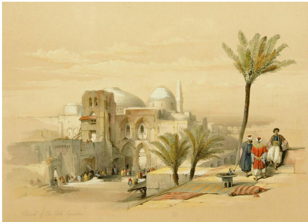
David Roberts Church of the Holy Sepulchre 1841 lithograph

Fifteenth Sunday of the Year 14 July 2024