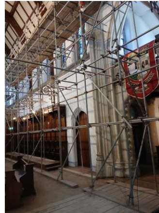
Two views of the scaffolding in place at Princethorpe this summer, installing fire precautions and amending the lighting