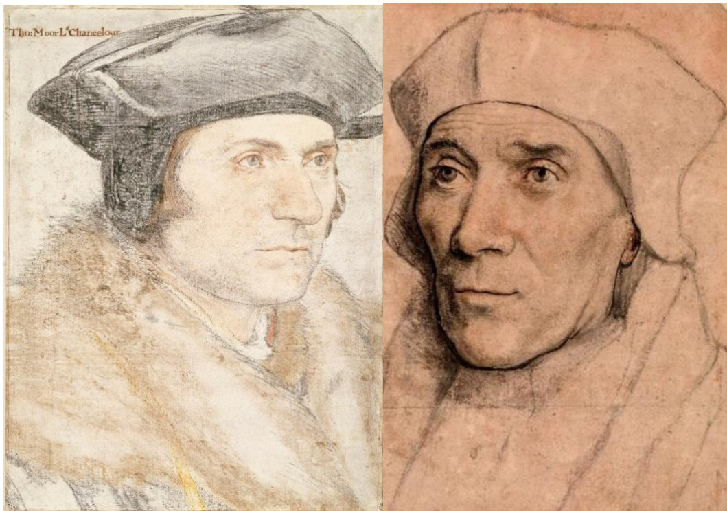
Hans Holbein the Younger (1497/98-1543) Sir Thomas More ca. 1527 The Royal Collection St. John Fisher after Hans Holbein the Younger, British Museum

Eleventh Sunday of the Year 16 June 2024