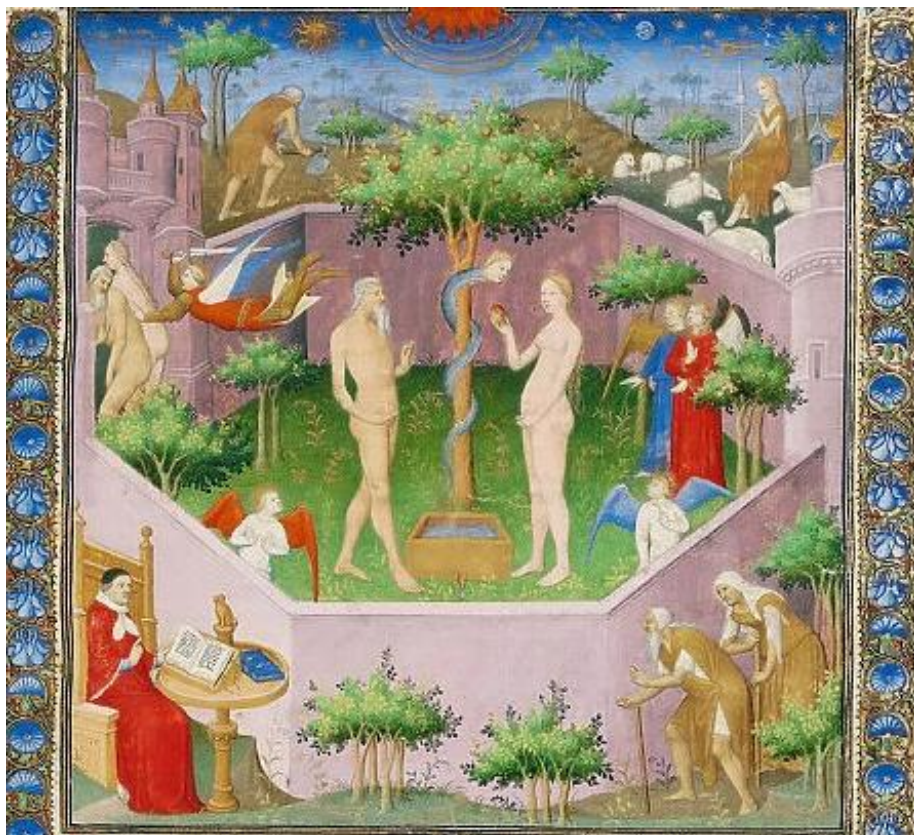
Boucicaut Master The Story of Adam & Eve , ca 1413-1415 J. Paul Getty Museum, Los Angeles