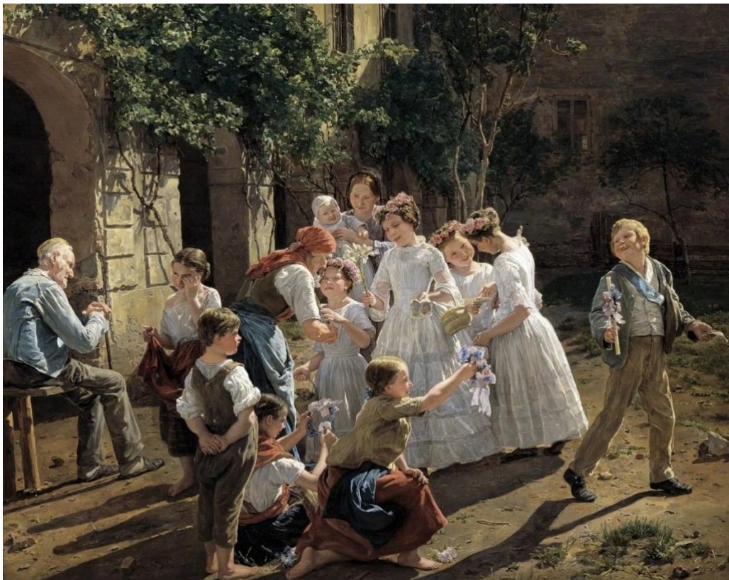
Ferdinand Georg Waldmüller On Corpus Christi Morning 1857 Belvedere, Vienna