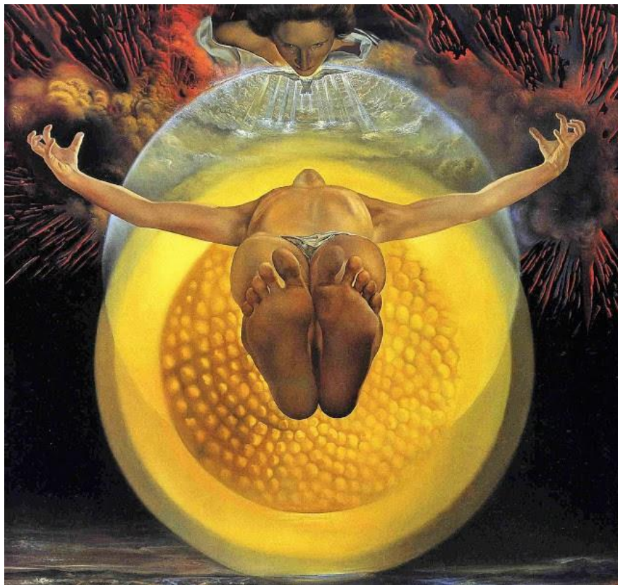
Salvador Dalí The Ascension of Christ 1958