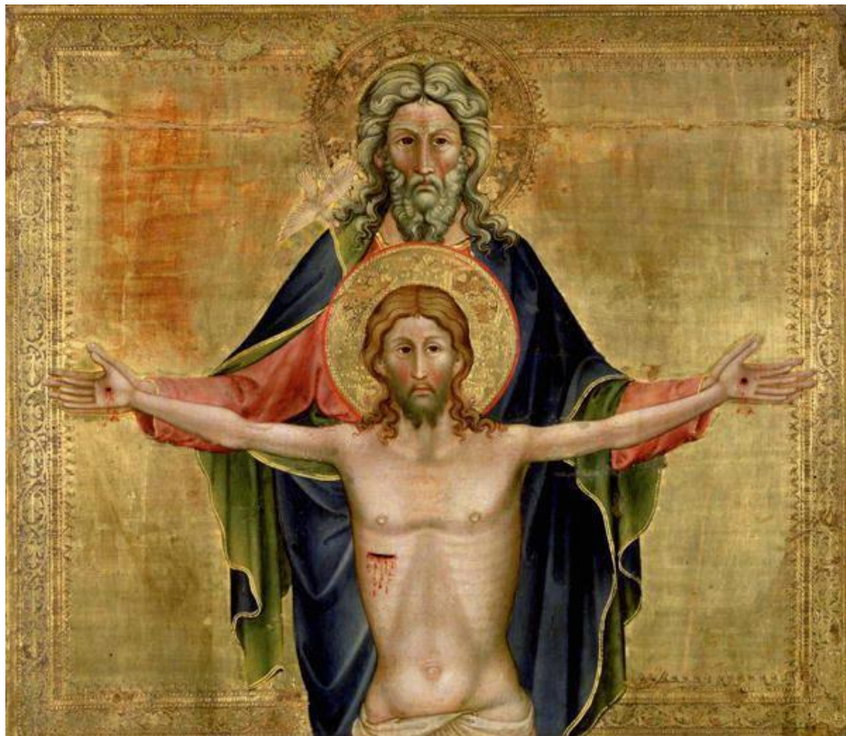
Nicolò Semitecolo The Holy Trinity c.1370 Diocesan museum of Padua