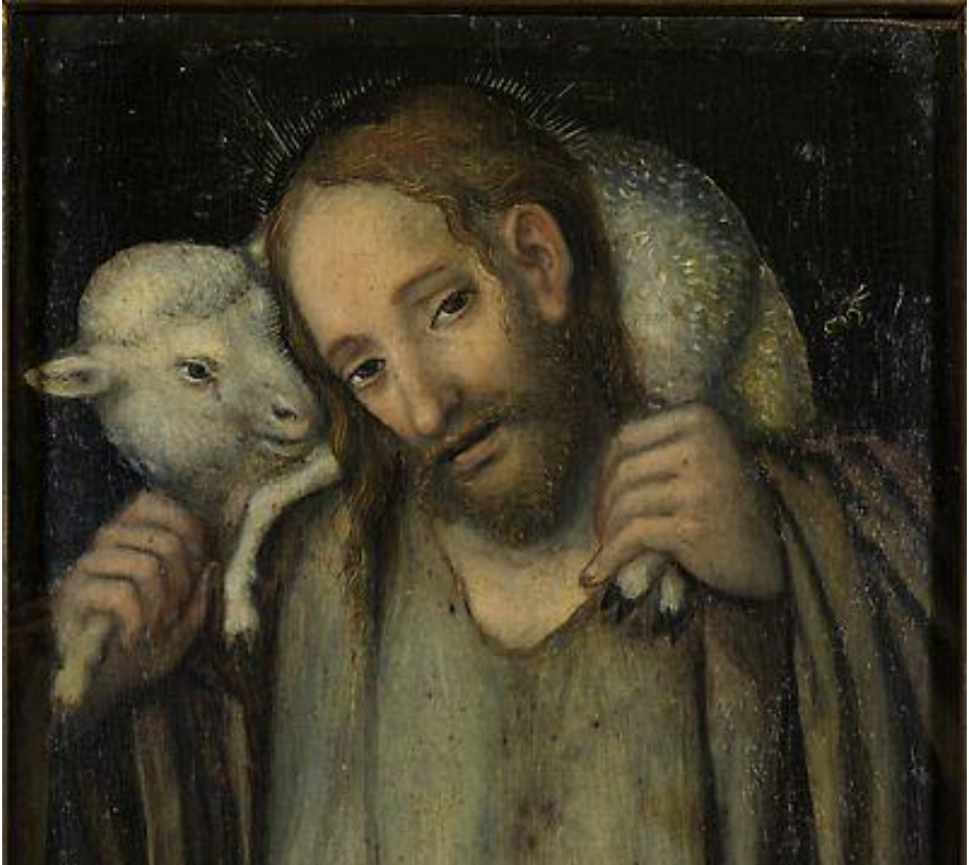
Lucas Cranach the Younger Christ as the Good Shepherd (detail) c.1540 Angermuseum, Erfurt