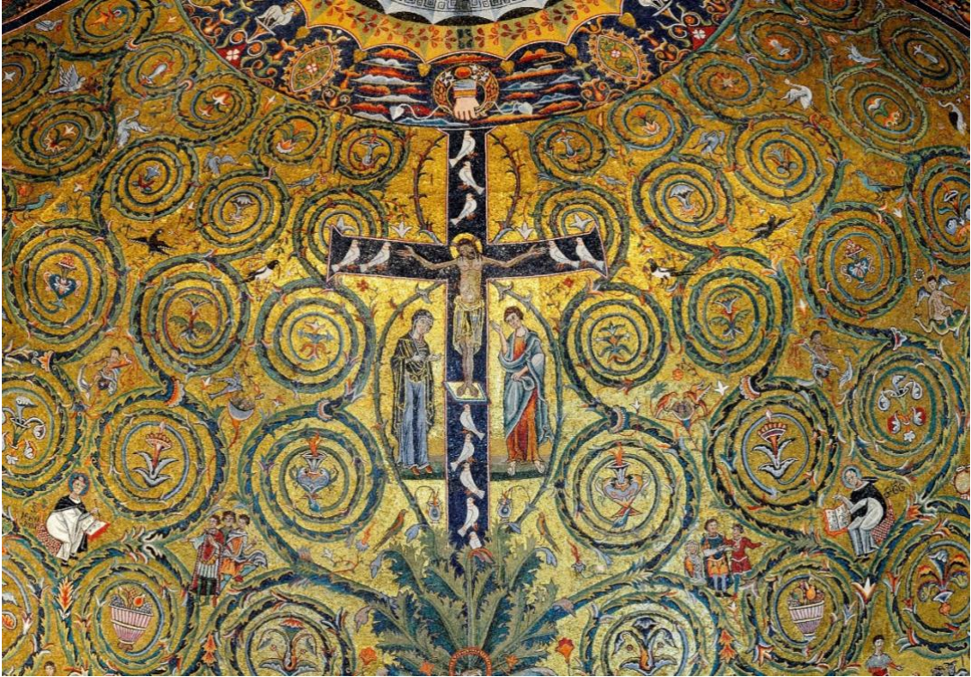
12 th Century apse mosaic (detail) with inscription: ECCLESIAM CRISTI VITI SIMILABIMUS ISTI (We represent the Church of Christ as this vine) Basilica of San Clemente, Rome