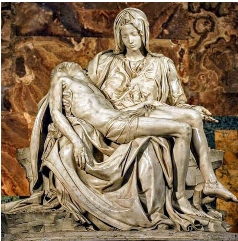
Michelangelo Pieta 1499 St Peter's Basilica, Vatican. Station Mass for the 5th Sunday of Lent