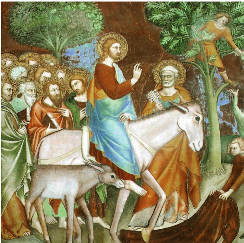
Lippo Memmi Christ's Entry into Jerusalem C.14 th Duomo, San Gimignano