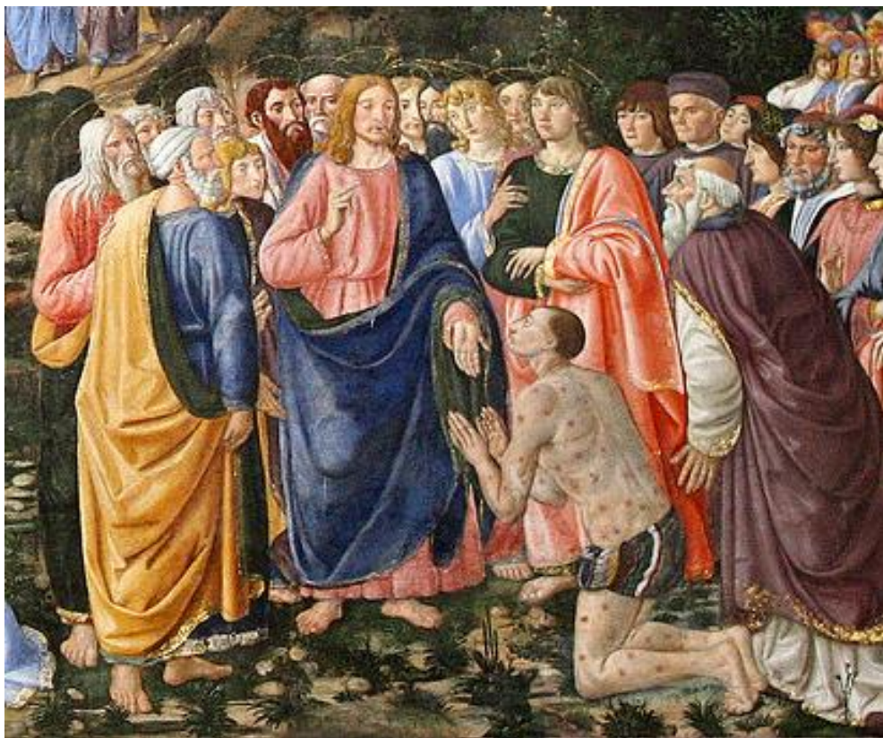
Cosimo Roselli Sermon on the Mount and the Healing of the Leper (detail) 1481-82 Sistine Chapel

Sixth Sunday of the Year 11 February 2024