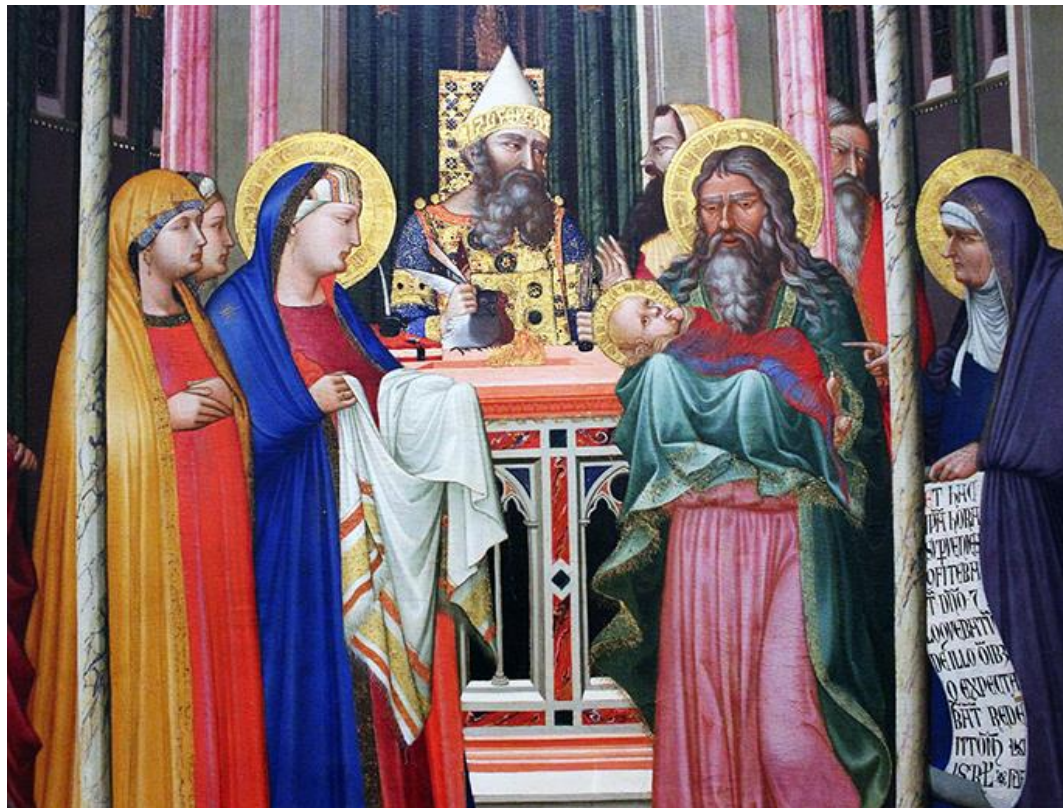
Ambrogio Lorenzetti The Presentation (detail) 1340 Uffizi Gallery, Florence

Fifth Sunday of the Year 4 February 2024