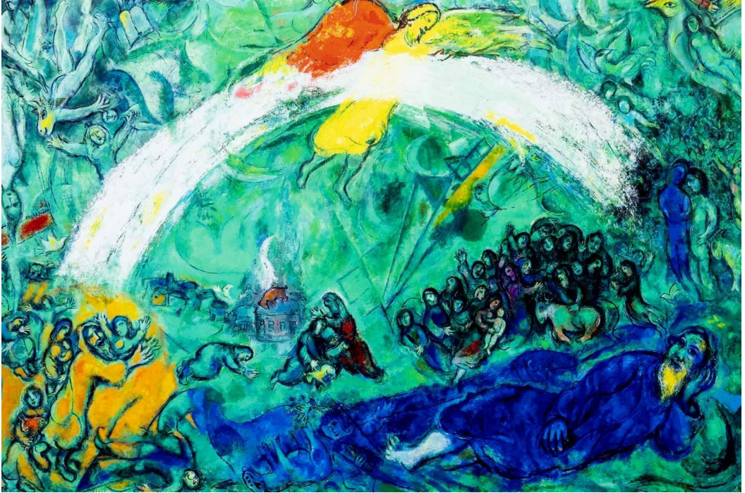
Marc Chagall Noah and the Rainbow 1966 Musée Marc Chagall, Nice