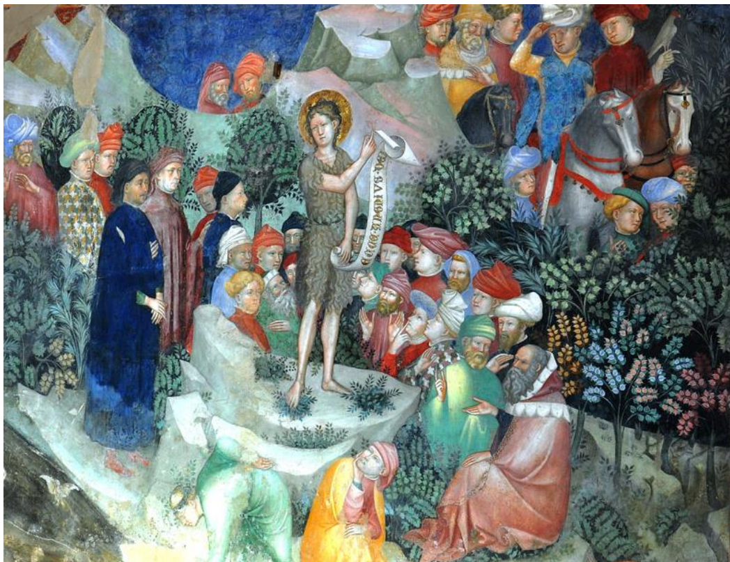
Lorenzo & Jacopo Salimbeni Ecce Agnus Dei from The Life of St. John the Baptist Fresco 1416 Urbino, Italy

Second Sunday of the Year 14 January 2024